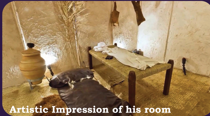
Artistic Impression of his room